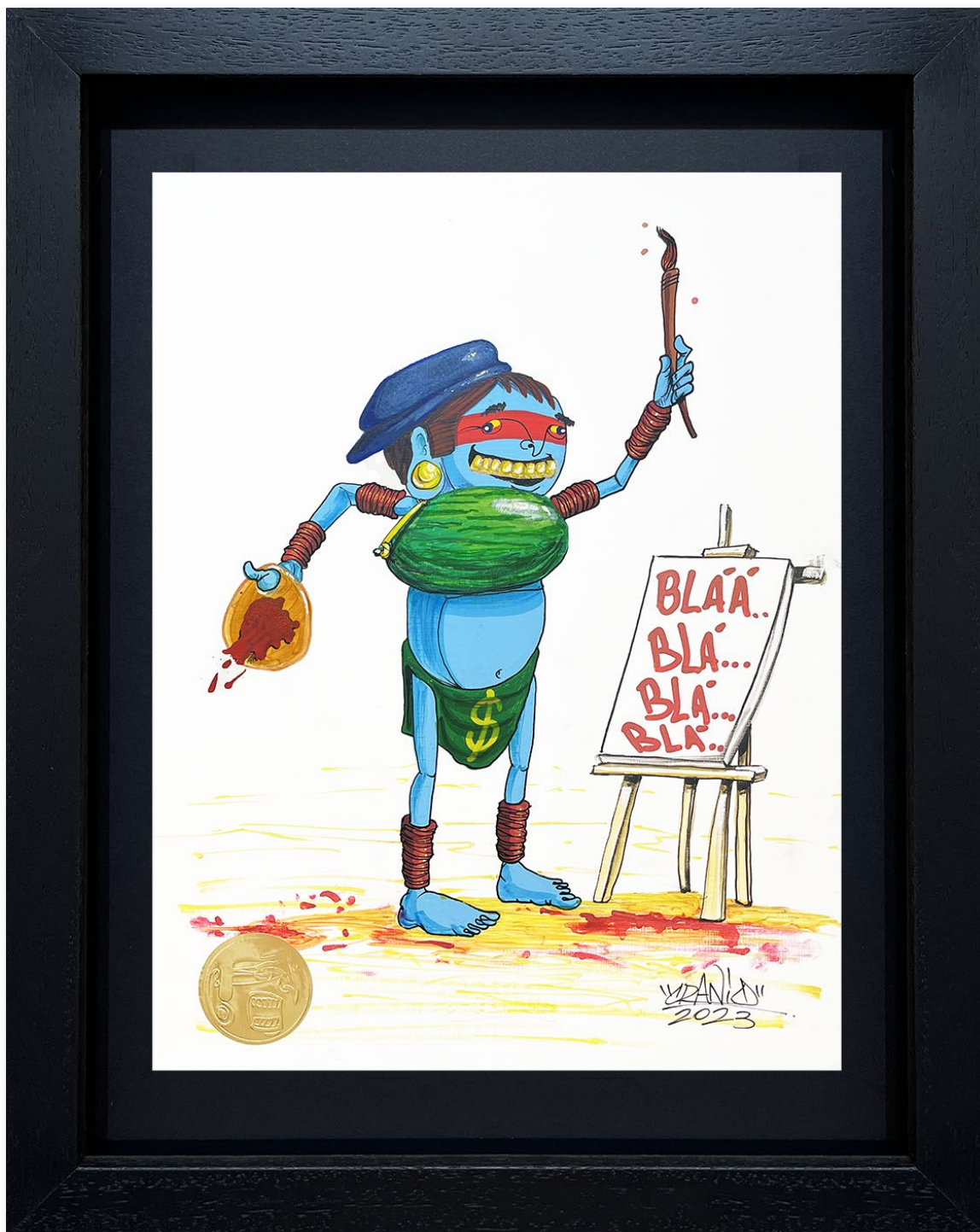
'Xamã of Consume, IV' (2024) Acrylic and Marker Pen on Paper 50 x 40cm (Framed) £1000