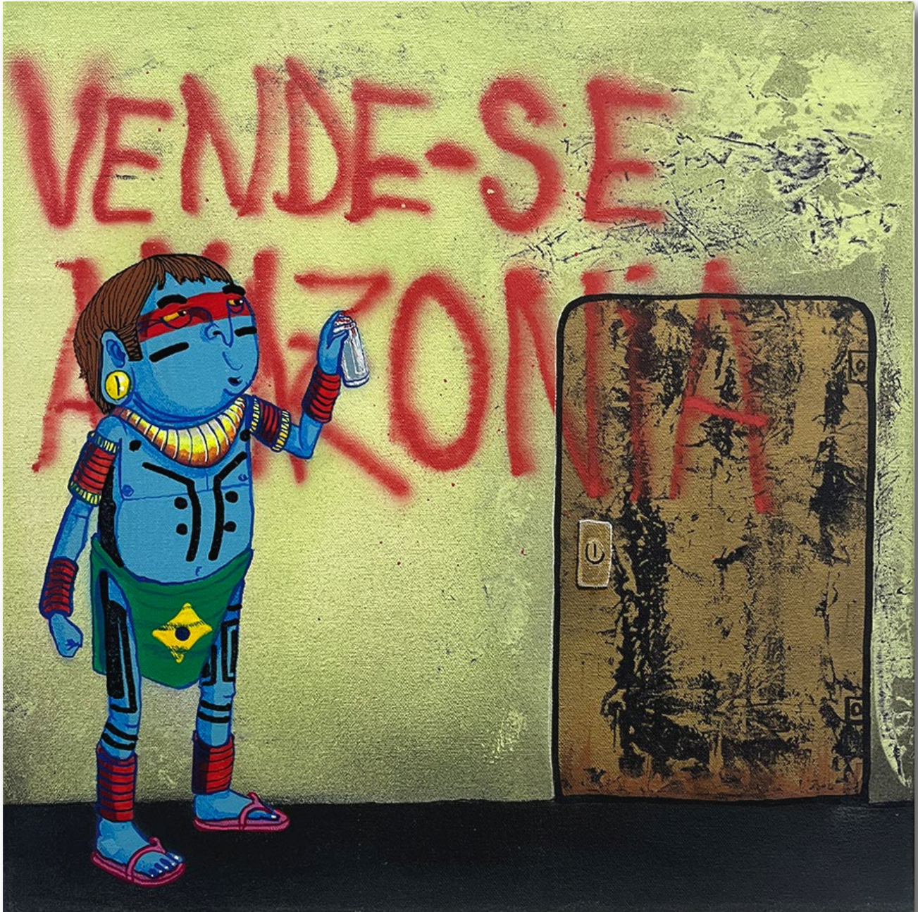
'Vende se Amazônia' (2024) Spray Paint and Acrylic on Canvas 35 x 35cm £1500