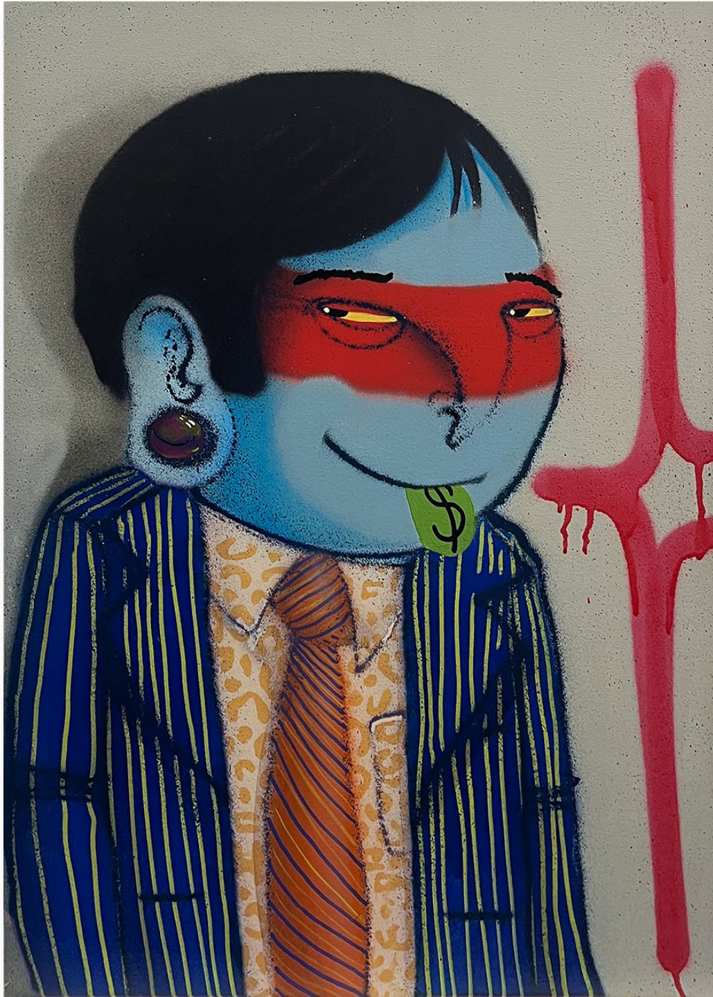
'Business Man, II' (2024) Spray Paint and Acrylic on Canvas 70 x 50cm £2850