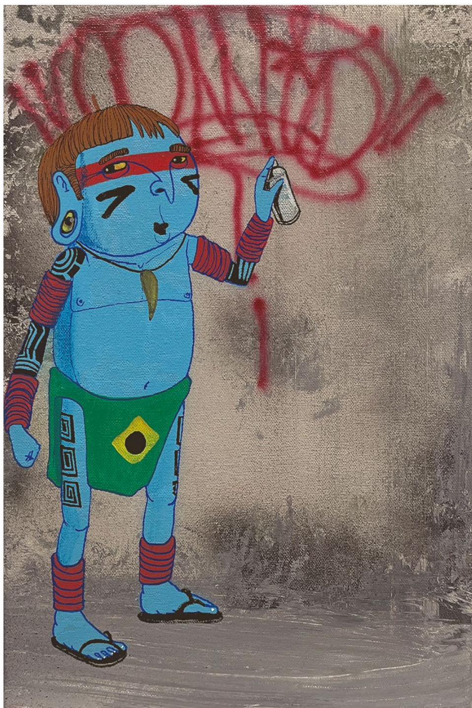
'Graffiti Is Not Ego' (2024) Spray Paint and Acrylic on Canvas 30 x 20cm £800