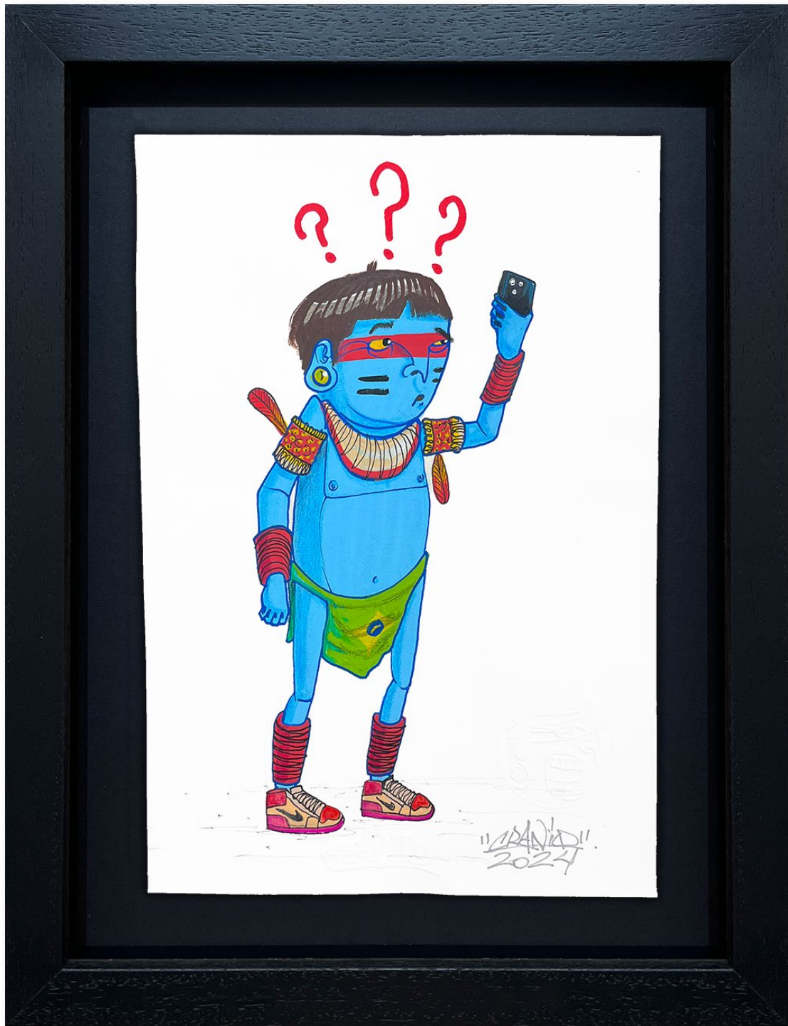
'Digital Life, IV' (2024) Acrylic and Marker Pen on Paper 40 x 30cm (Framed) £800