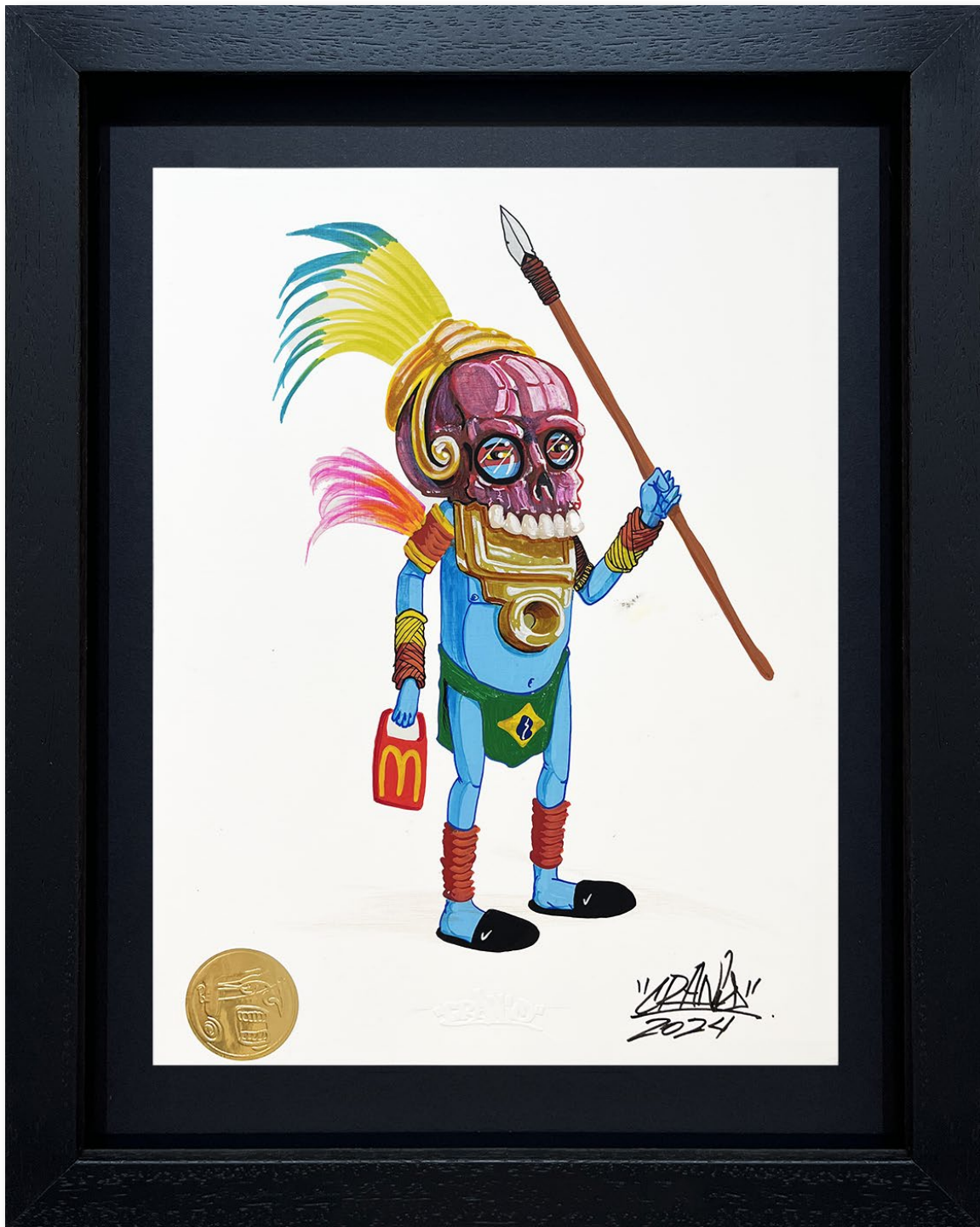
'Xamã of Consume VIII' (2024) Acrylic and Marker Pen on Paper 50 x 40cm (Framed) £1000