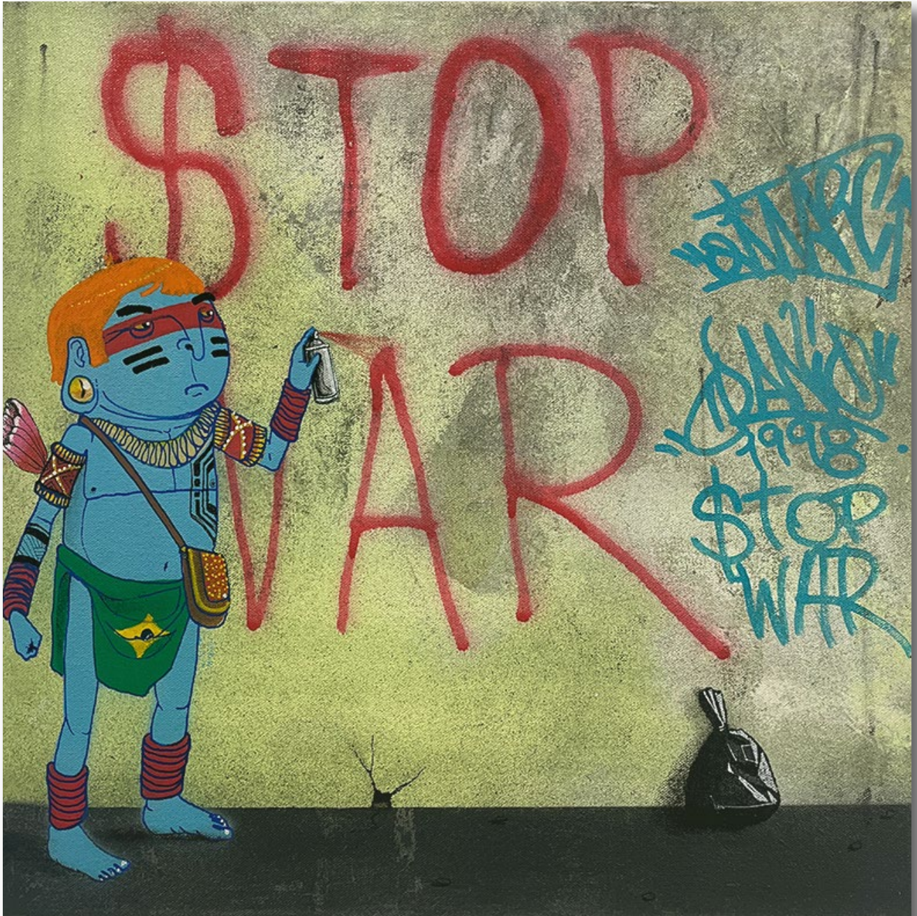
'$top War 1998' (2024) Spray Paint and Acrylic on Canvas 35 x 35cm £1500