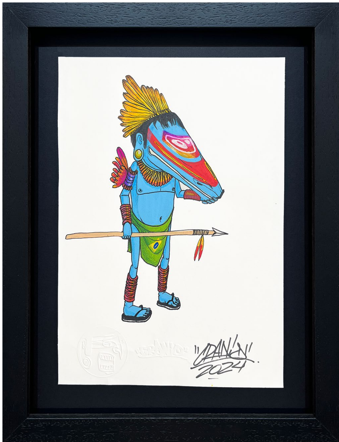
'Digital Life, I' (2024) Acrylic and Marker Pen on Paper 40 x 30cm (Framed) £800