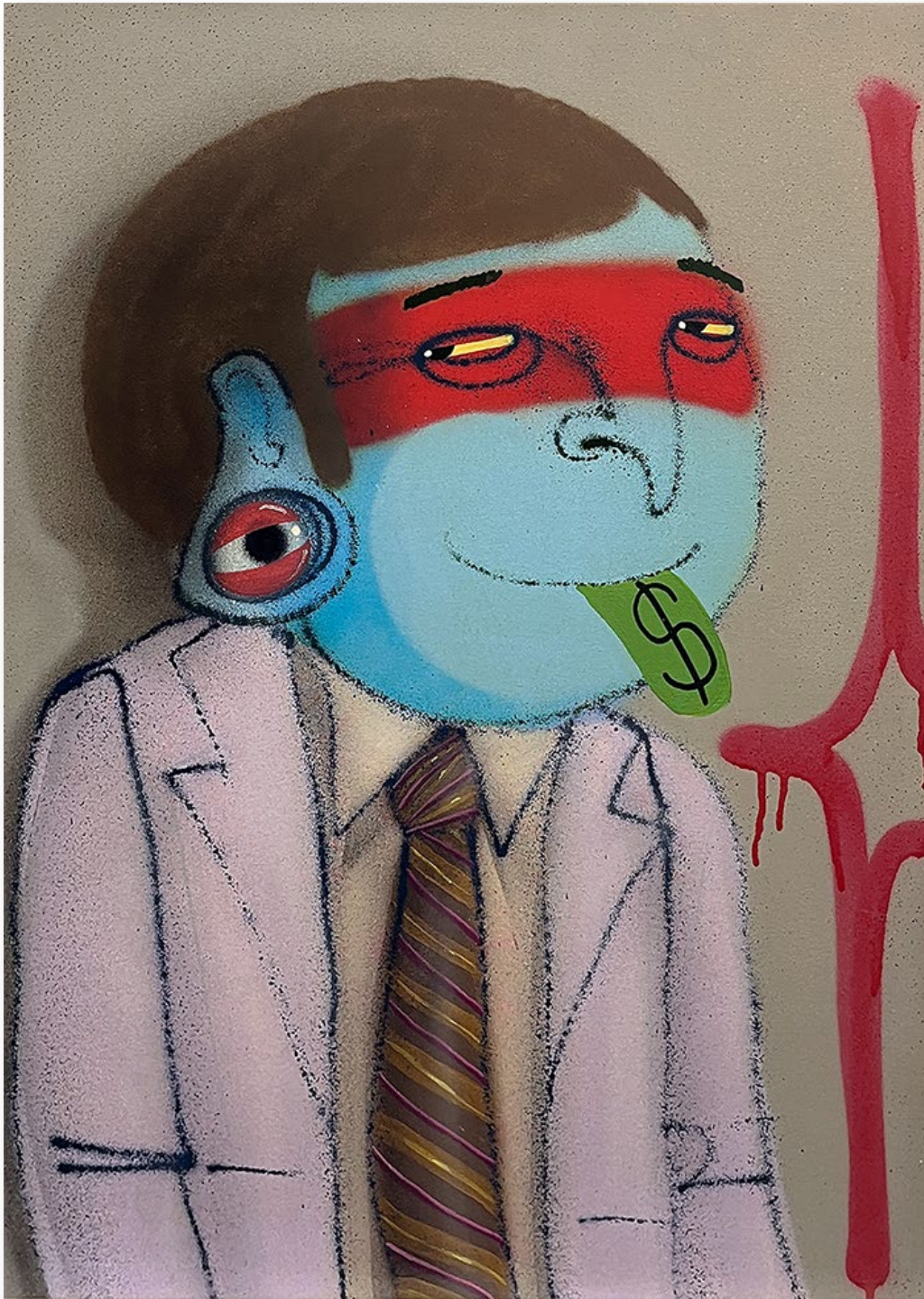
'Business Man, I' (2024) Spray Paint and Acrylic on Canvas 70 x 50cm £2850