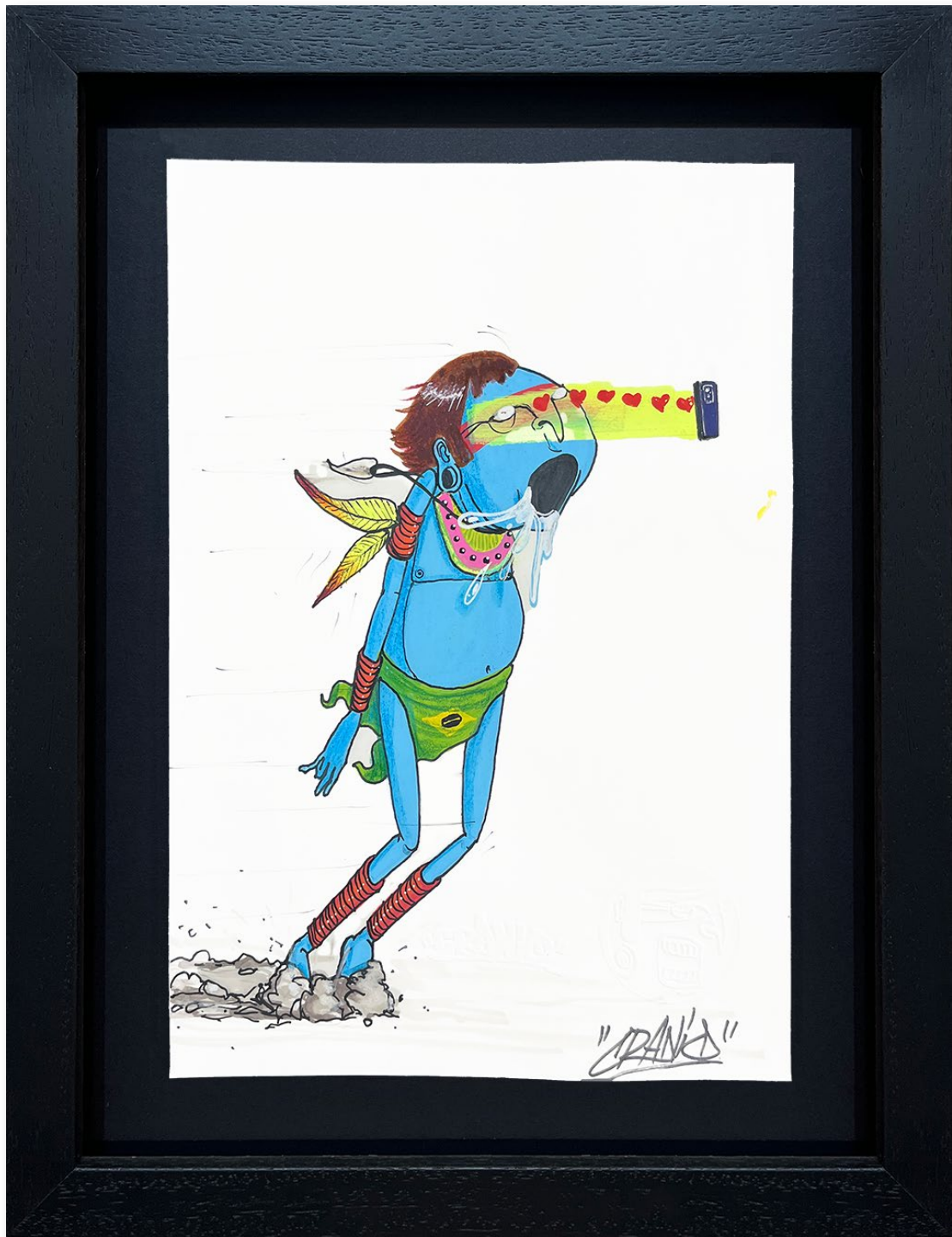
'Digital Life, II' (2024) Acrylic and Marker Pen on Paper 40 x 30cm (Framed) £800