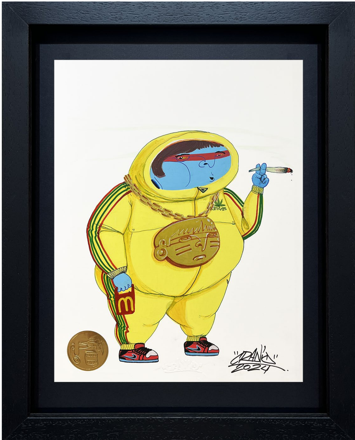
'Xamã of Consume, VI' (2024) Acrylic and Marker Pen on Paper 50 x 40cm (Framed) £1000