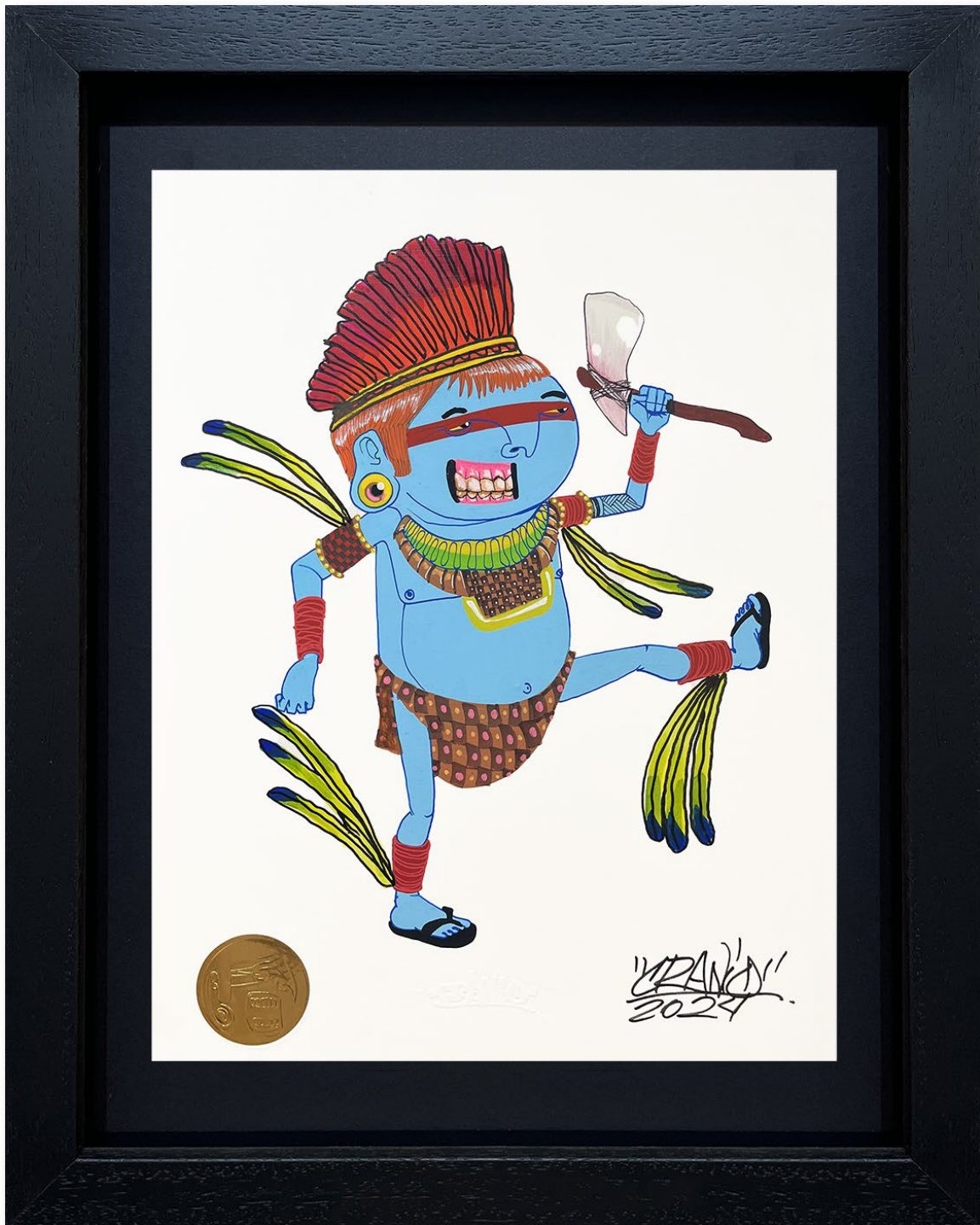
'Xamã of Consume, II' (2024) Acrylic and Marker Pen on Paper 50 x 40cm (Framed) £1000