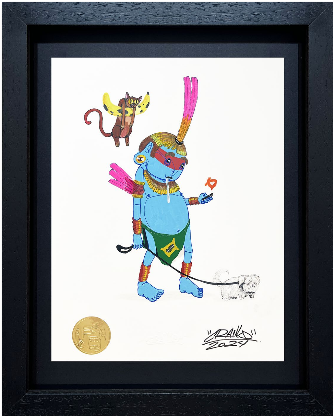
'Xamã of Consume, I' (2024) Acrylic and Marker Pen on Paper 50 x 40cm (Framed) £1000