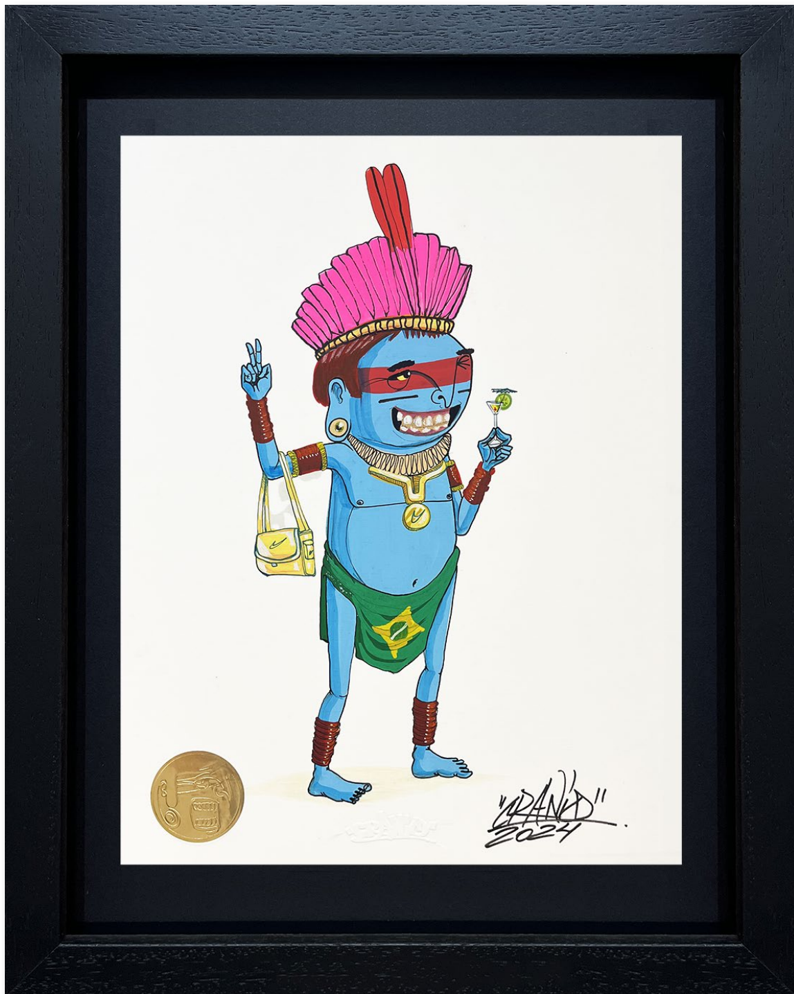
'Xamã of Consume, V' (2024) Acrylic and Marker Pen on Paper 50 x 40cm (Framed) £1000