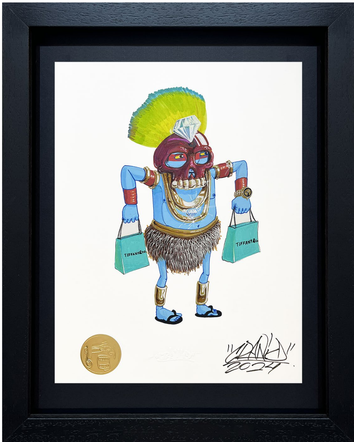
'Xamã of Consume, III' (2024) Acrylic and Marker Pen on Paper 50 x 40cm (Framed) £1000