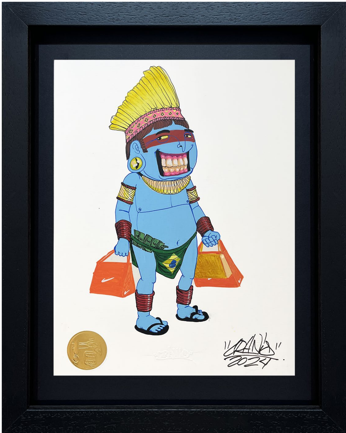
'Xamã of Consume VII' (2024) Acrylic and Marker Pen on Paper 50 x 40cm (Framed) £1000